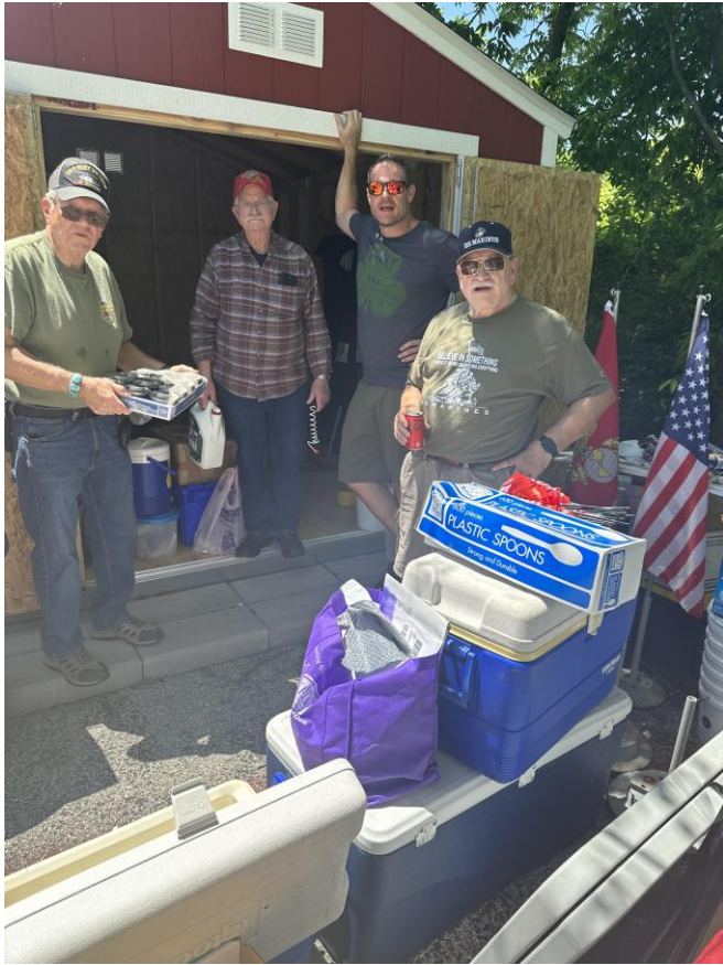
The Sunday Shed cleanup Project, May 18, 2025